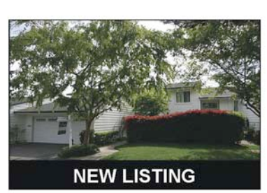
784 Country Club Dr., Moraga Contemporary Style - Great Setting 2 BR + Office, 2.5 BA - $839,000

Your experience, advice, strategy and hard work make The Olsen Team the most competent Realtors with whom we have ever worked.