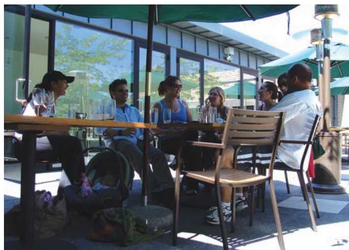
Happy al fresco diners

The interior, designed by Sheahan + Quandt of Berkeley, is simple and beautiful. It is far too elegant for me to be comfortable with the kids; another reason to head towards the patio. Casting a somewhat wistful glance at the well-stocked bars, both beverage and raw, I herded my entourage outside to a table that was as out of the way as possible. The sturdy wooden table was large enough to accommodate all of us with our place settings, beverages and shared appetizers and not risk glasses careening over the edge, and tables are set far enough apart so that each group has a modicum of privacy and you don't have to squeeze between other diners just to reach your chair. Large umbrellas