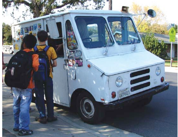
The ice cream man on School Street in Lafayette

he ice cream man truck industry has changed quite a bit since my day. When we heard the tinny rendition of...what was that song? We ran into the house, begged for a few quarters and the chase was on for blocks. I balanced one sister on the back of my banana seat and another on the handlebars...'look Ma no helmets! I braved busy streets and honking horns. I fought for my cream. The ice cream man? Well his job was rough too. He would drive fast then slow masterfully playing his funky tunes. He worked 'til dusk- he worked hard for the money.