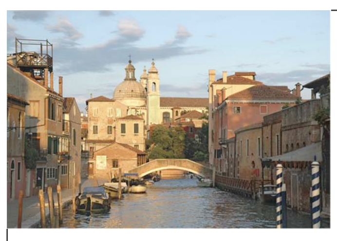
If you've got a great shot ... create an art print