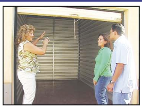
We can help you get organized to get more room at home, in your office or your garage!