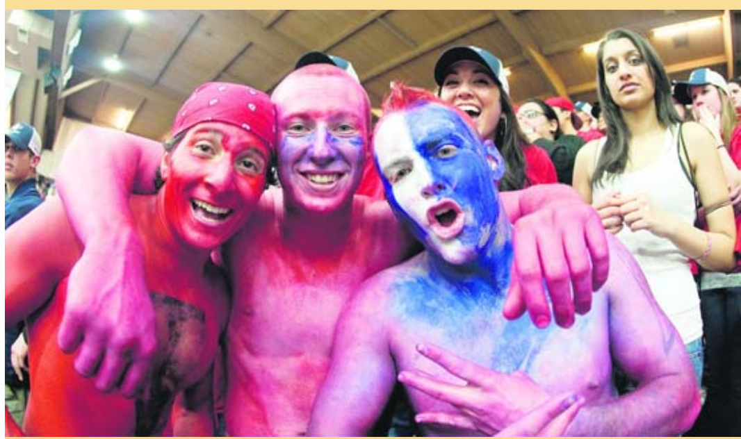
Extreme Red Zone