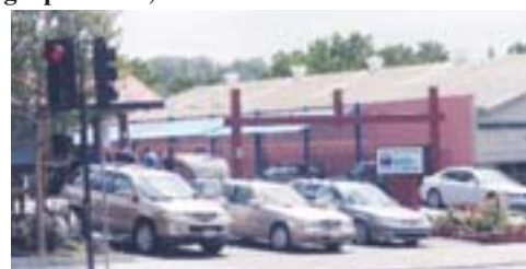
Lafayette Car Wash on Mt. Diablo Blvd.

Lafayette Car Wash Recognized by EBMUD for its Recycling Operations, 3319 Mt Diablo Blvd, Lafayette, 283-1190, www.lafayettecarwash.com In "The Pipeline," EBMUD's newsletter, the Lafayette business was recognized as a car wash that recycles 50 to 60% of its professional water use. Lafayette Car Wash only uses about 25 gallons per wash because of its highly efficient equipment. Using a professional car wash that recycles the water not only saves water, it also prevents sending harmful detergents to our ground water and storm drains, a common occurrence when washing cars in front of homes.