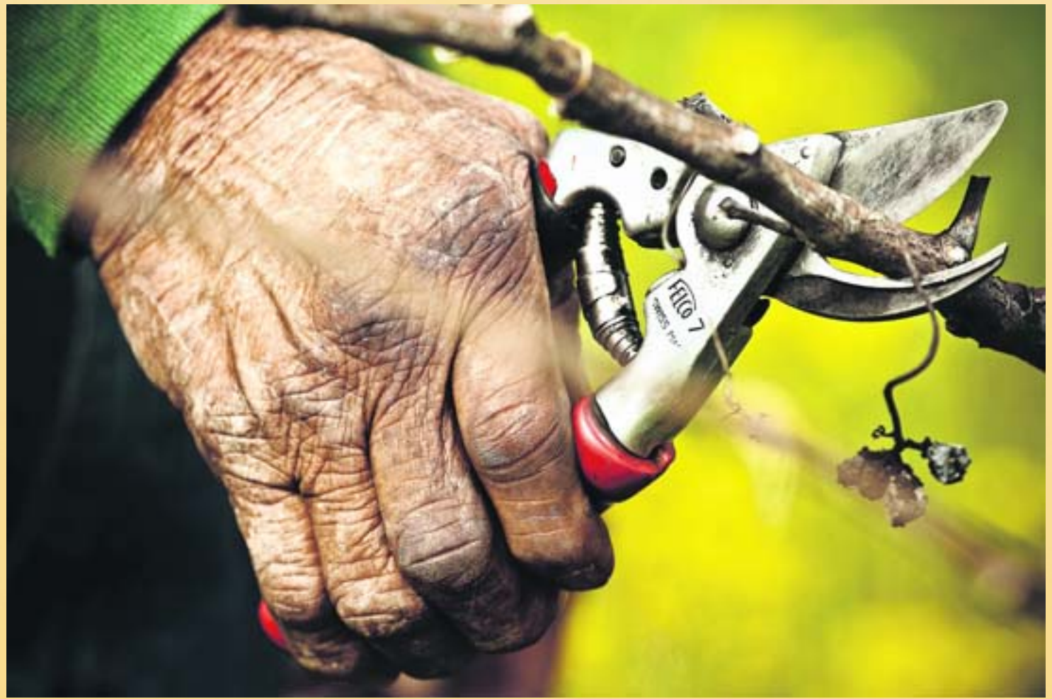
Second place "Timeless"