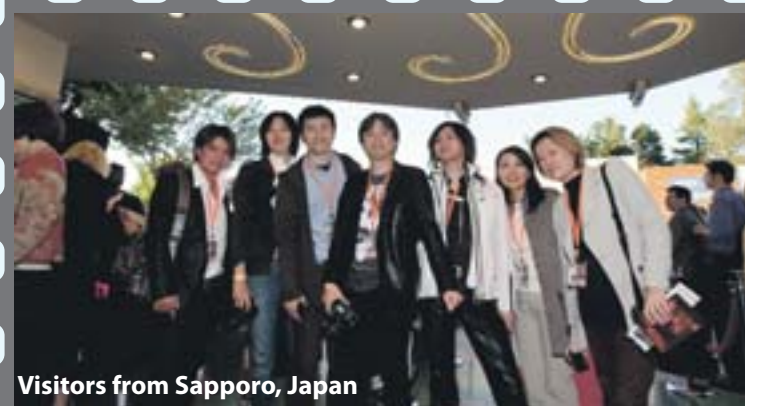
Visitors from Sapporo, Japan