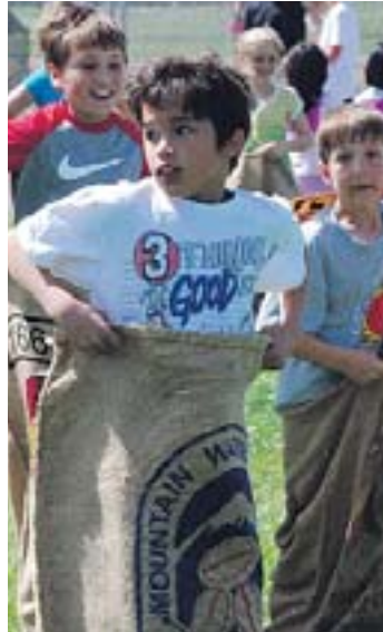
Sack race

On June 2nd, Rotary Club of Moraga held a fun Field Day for third, fourth, and fifth graders in the Moraga School District at Joaquin Moraga Intermediate School. 222 boys and girls participated in this Field Day, held for the 19th straight year, in events such as sprints, relays, sack races, long jumps, and football/softball throws. Medals were awarded to the top three contestants in each event.