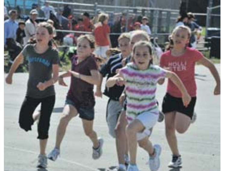
Sprint

Los Perales School was recognized for having the most participants, and Donald Rheem School won the plaque for the most points