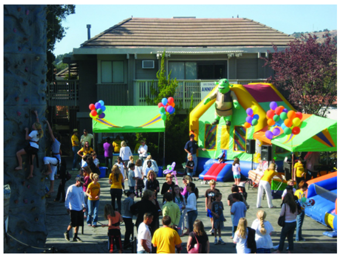
Hudson & Axelrode Orthodontics hold their annual client event fair in Moraga

October 21, City Time Capsule Ceremony & Community/Council Reception at City Hall, from 3:00 to 6:00 p.m. This community event is part commemoration of the City of Orinda 25th Anniversary.