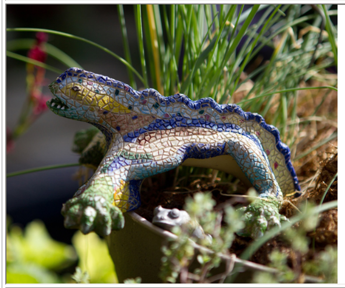
Hidden treasures: Beaded birds and a ceramic salamander hanging out in the garden