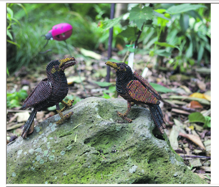
Hidden treasures: Beaded birds and a ceramic salamander hanging out in the garden