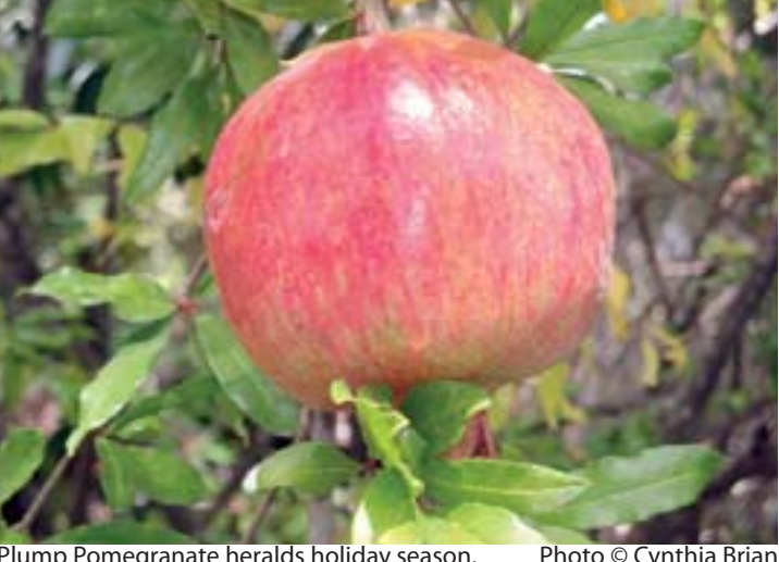
Plump Pomegranate heralds holiday season.