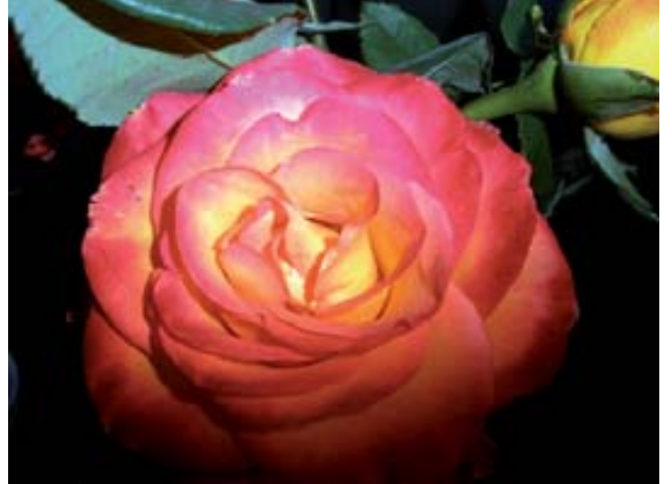
The perfect November rose in hues of Thanksgiving.