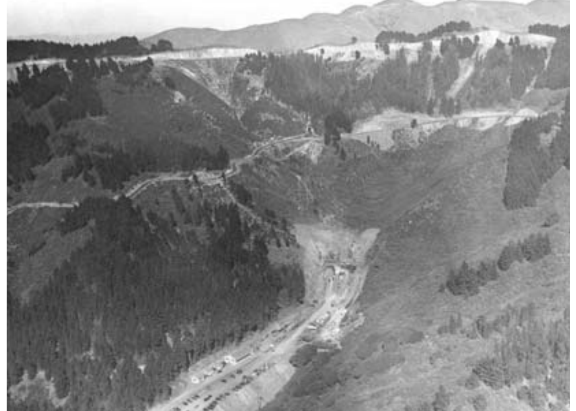
Construction of bores 1 and 2.