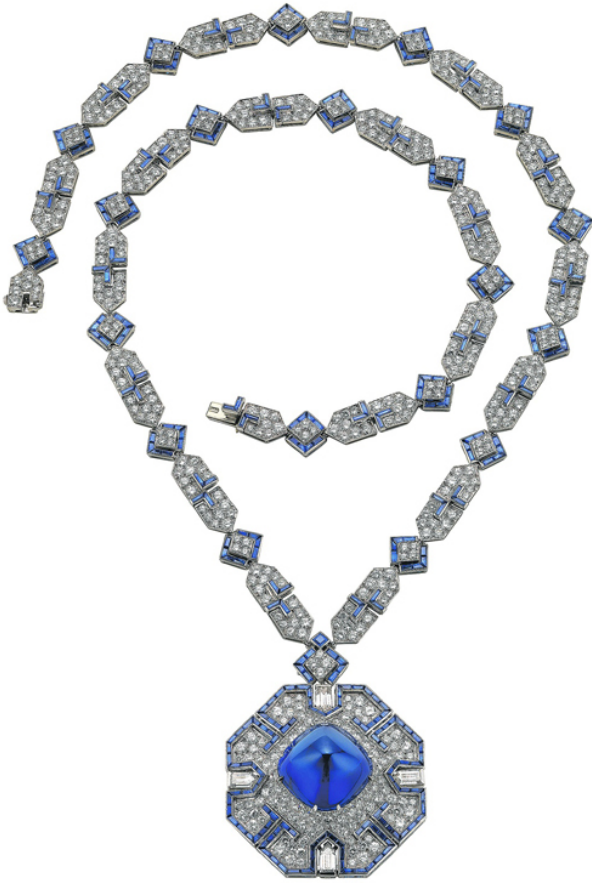
Bulgari pendant, 1969. Formerly from Elizabeth Taylor's private collection.