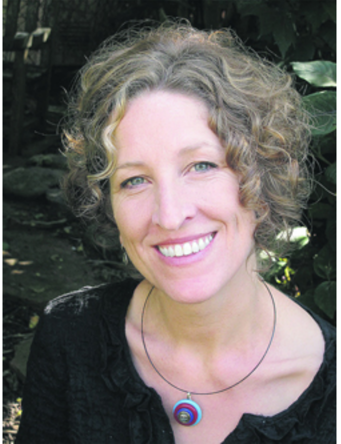
Monica Wesolowska

A poignant memoir about the tragic task of letting go By Lou Fancher