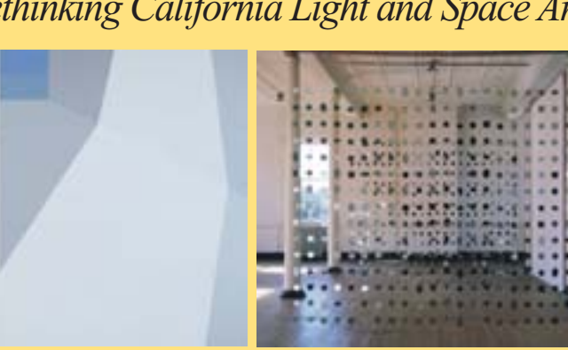
Helen Lundeberg Untitled (known as Blue View), 1974 Acrylic on canvas, 60 x 60 inches

Keith Gallery has been converted to a mini-theater for Afterglow videos. A new Keith exhibit will open Oct. 20.