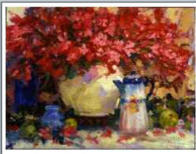
Florals, Still Life, Landscape, Figurative