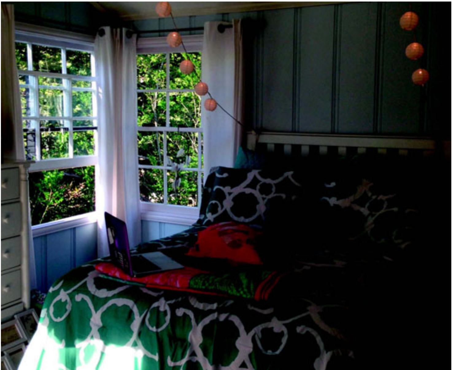
Color doesn't have to be daunting. Use fresh colors, like in this Lafayette bedroom.

Feng shui can create the energetic possibilities you need to discover the home of your dreams. When you move to a new home, don't forget about the importance of space clearing the previous owner's Qi since you want the home to be truly yours.