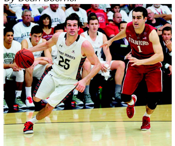
Joe Rahon Photos Tod Fierner

Both Saint Mary's basketball teams are projected to be top-four finishers in the WCC, but they couldn't be more different. The men are young and have a perimeter-oriented offense, while the women are replete with veterans looking to score in the paint.