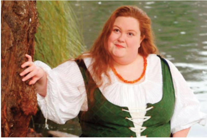
Soprano Litz Plummer

Reach the reporter at: info@lamorindaweekly.com