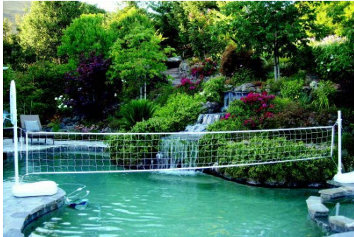
Lush landscaping plus swimming, volleyball, and a waterfall.