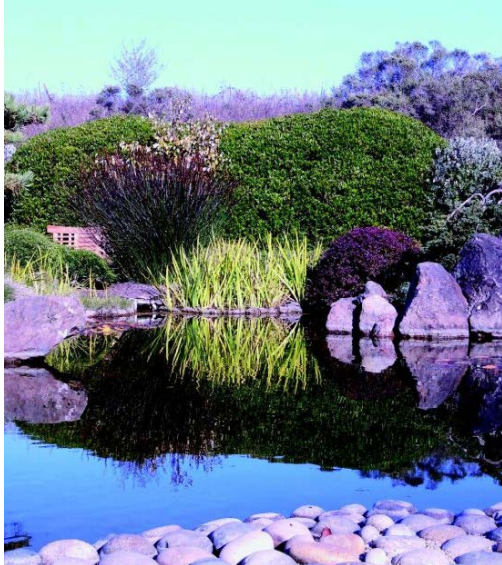
A serenity pool mimics a natural lake.