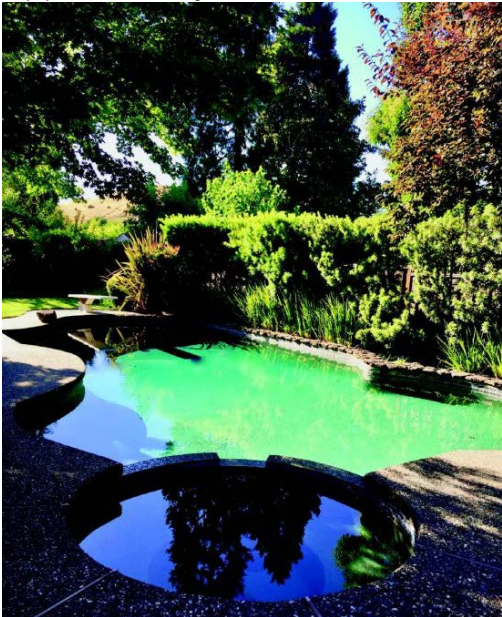
Trees cast striking shadows on this tranquil pool and spa.