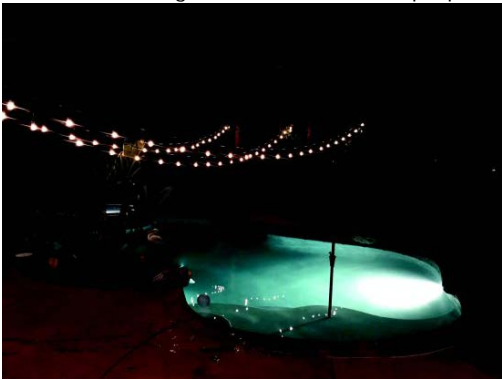
Lights in and around a tropical pool add elegance to the night landscape