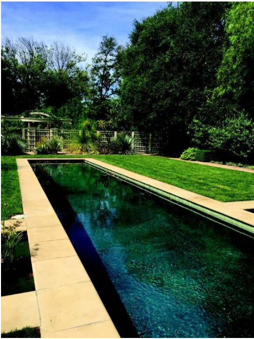
Lap pool, flanked by lawn, with an ethereal arbor at one end.