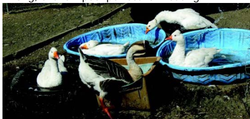
Splish, splash we are taking a bath! Even these geese love private pools!