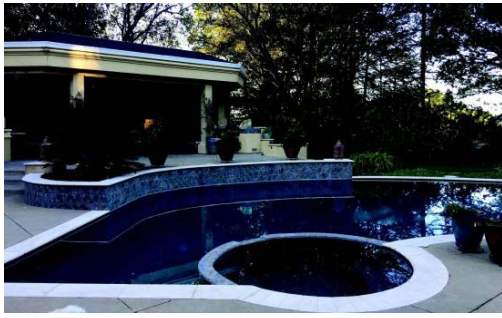
An elegant cabana offers pristine poolside dining.