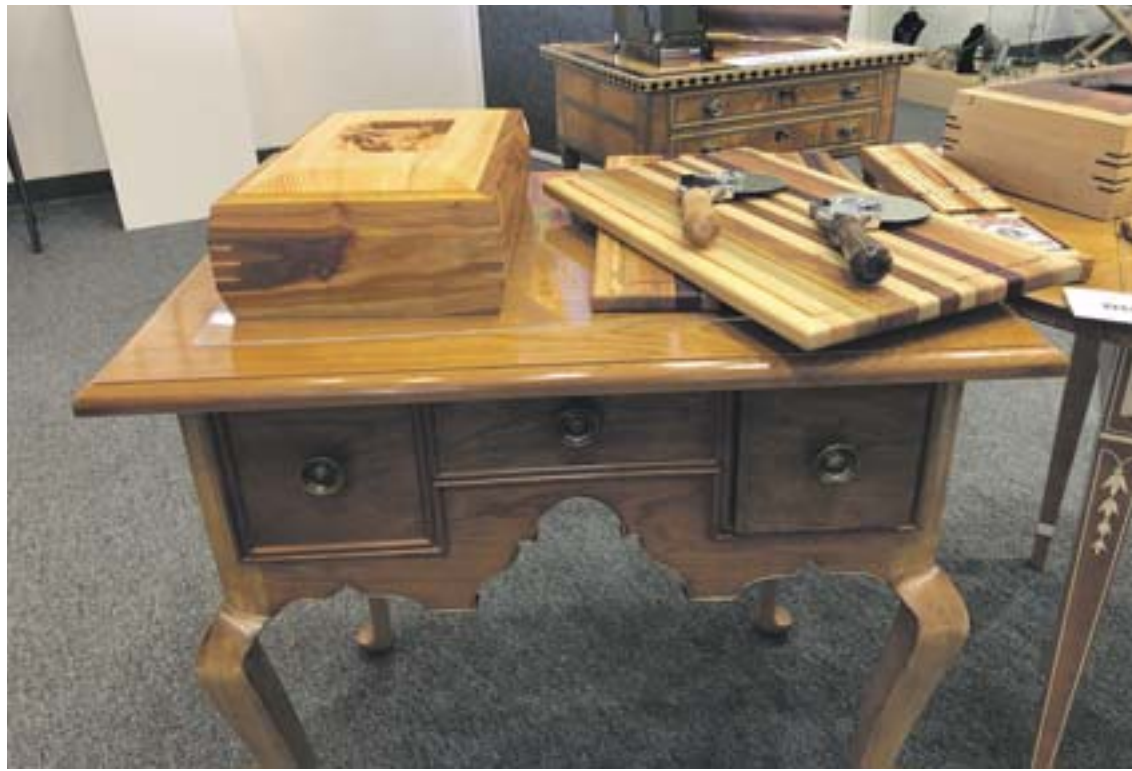
Woodwork by Duke Herrero