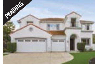
ZOCCHI & ASSOCIATES 925.360.8662