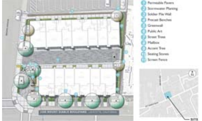
Aerial site view