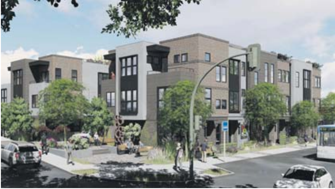
View from Mt. Diablo Boulevard