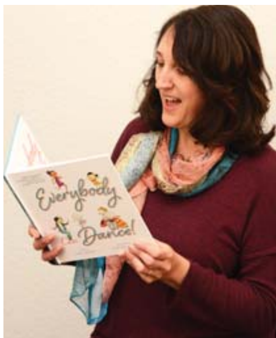
Local author reads her book