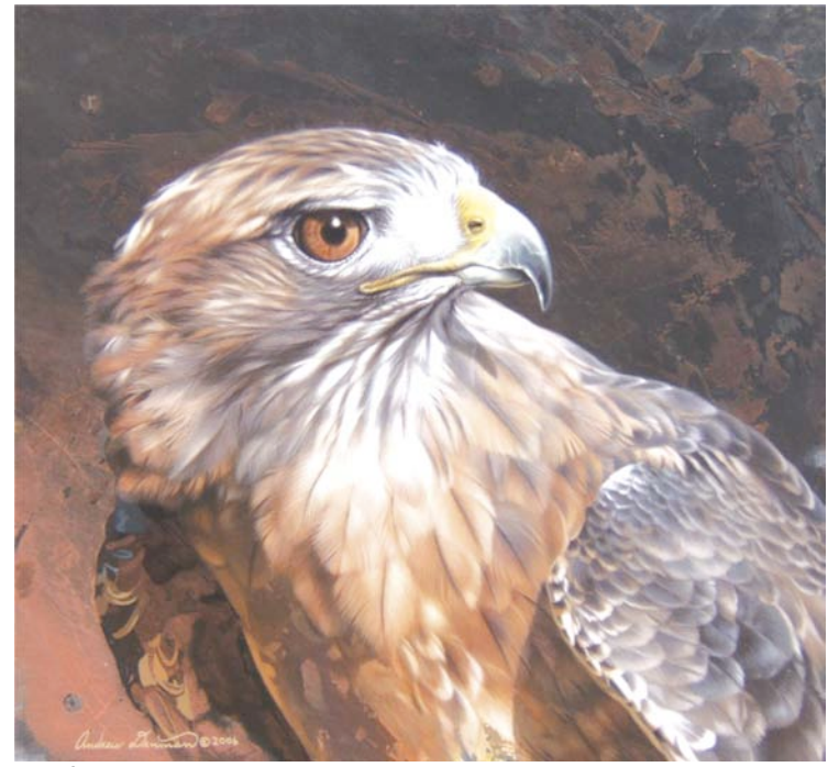
"R is for Raptor"