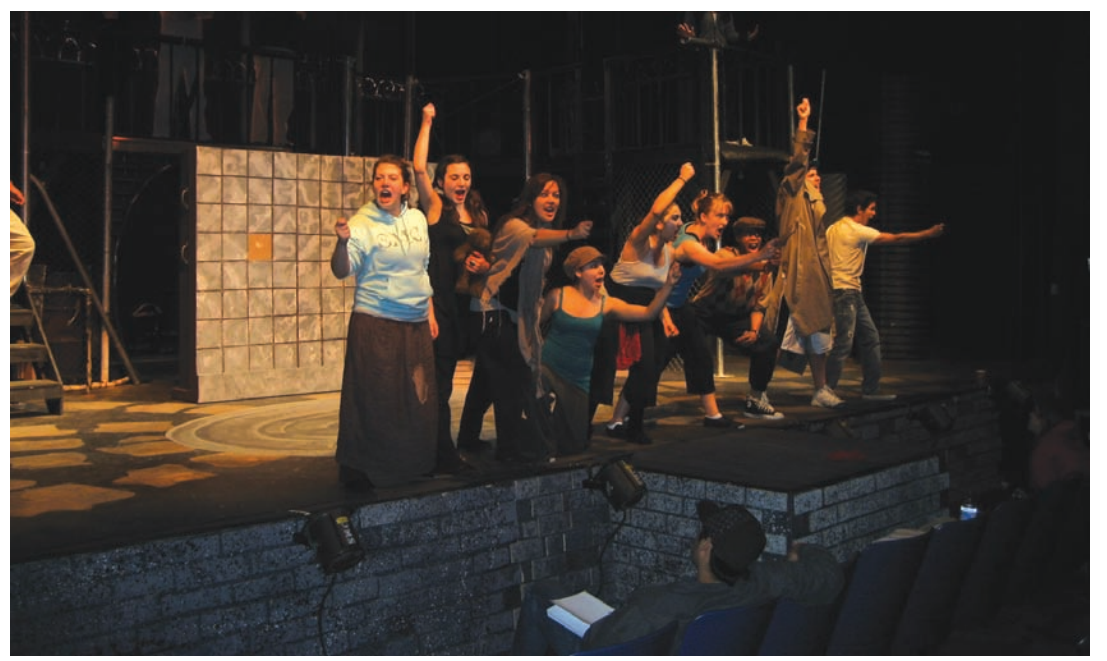
Saint Mary's cast in rehearsal at LeFevre Theatre.

The induction ceremony will begin with a reception at noon followed by the Hall of Fame banquet at 1 p.m. in the Soda Center. Registration is available through the Saint Mary's alumni office at 925-631-4200 (deadline is April 23). Tickets are $50 per person, $30 per child.