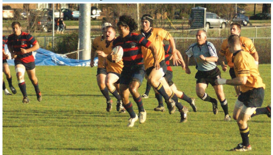
Gaels men's rugby takes on Army in thrilling contest.