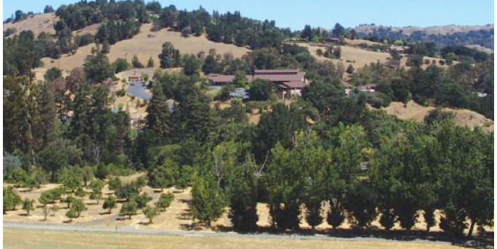
Sanctuary and Temple Isaiah Classroom Building from Reservoir Parking Lot

The Planning Commission heard an initial proposal last week from the Contra Costa Jewish Day School, a K-8 parochial school, which is requesting a land use permit and development permit to expand its existing facility at 3800 Mt. Diablo Blvd.