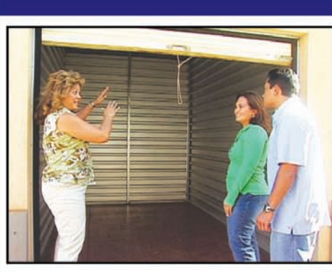
We can help you get organized to get more room at home, in your office or your garage!