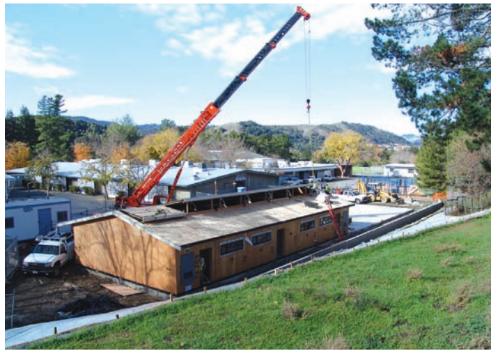
J.D. Arrighi & Mike Snow, Meehleis Modular Building Inc., set a roof piece on Saturday morning

The frames used at CP are 10' x 32'. One classroom requires four frames plus one that's shared by two classrooms, creating additional meeting