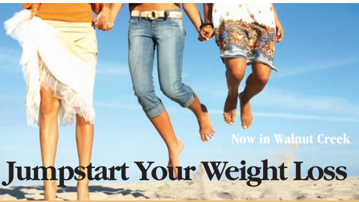
Now in Walnut Creek