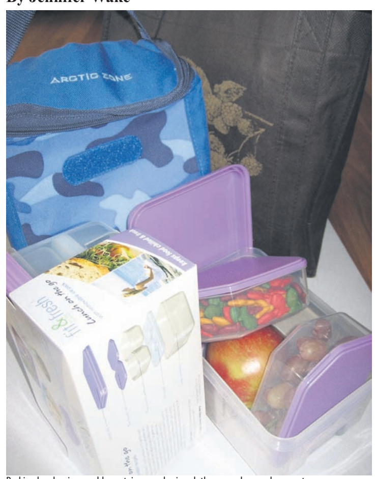
Packing lunches in reusable containers and using cloth grocery bags reduce waste

t this time of year, dieting is Ain vogue. Starting a carbon diet (taking steps to reduce your carbon footprint and to help stop global warming) is no exception.