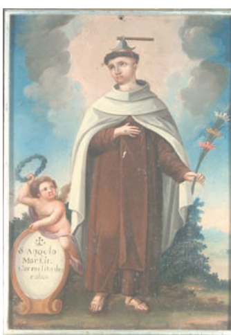
St. Angelo the Martyr - Maker unknown; h. 14 x w. 10 inches

http://www.stmarysca.edu/news-and-events/focusthe-nation/index.html