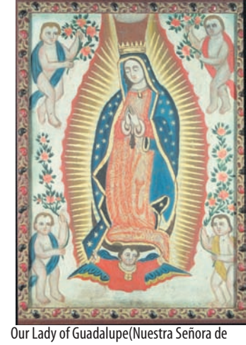
Guadalupe) Maker unknown; h. 13 3/4 x w. 9 5/8 inches; oil on tin