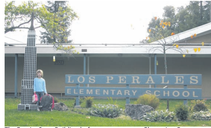
The Empire State Building before...

Schafer is supportive of juvenile diversion programs for teenage vandals. "I have had experience with juvenile diversion programs in my former district. When young people committed