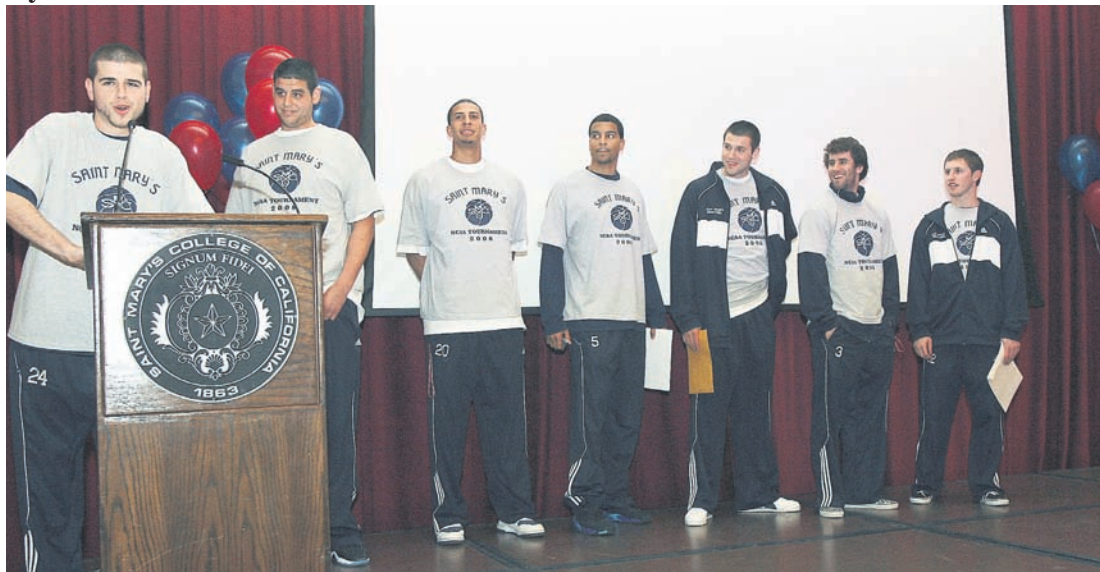
SMC players talk to fans, media at the College following the NCAA Division I selection announcement