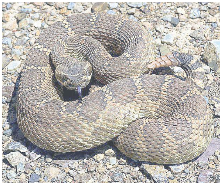
Northern Pacific Rattlesnake: thin neck and a large triangular head; usually with a light stripe extending diagonally from behind the eye to the corner of the mouth.