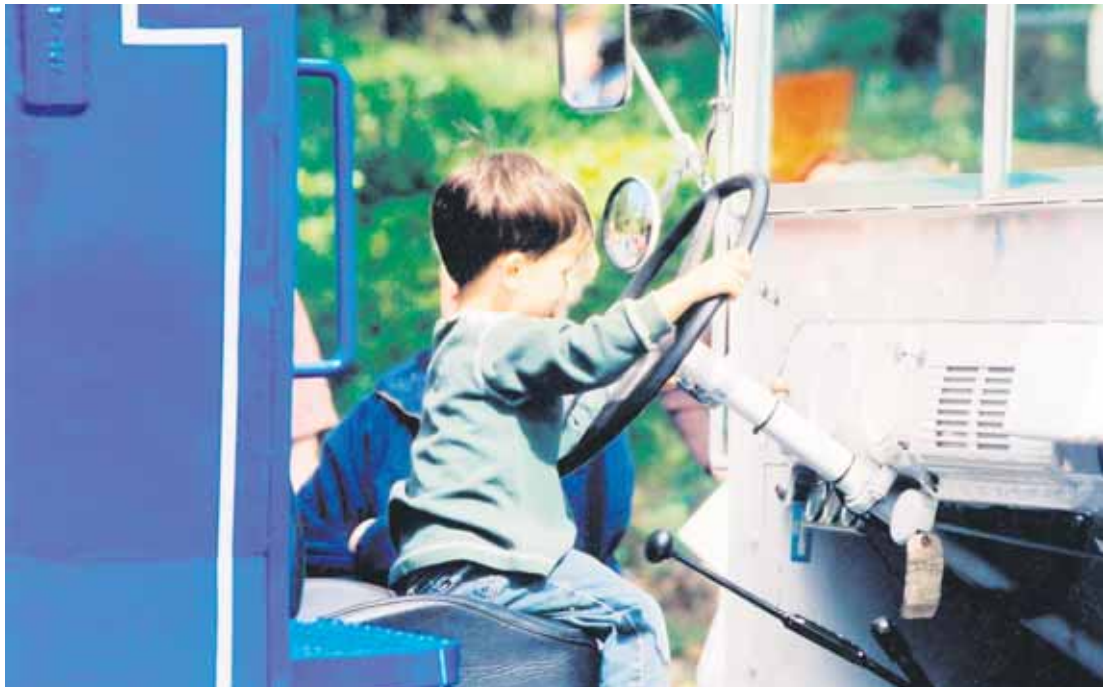
A boy enjoys a truck at last year's Wheel Day

hat kid wouldn't love to sit on a real motorcycle or climb inside a fire truck, ambulance or garbage truck? Bring your children to the twelfth annual Wheel Day, Saturday April 26, from 9:30 a.m. to 12 noon, at the Lafayette-Orinda Presbyterian Church (LOPC) where they'll have the opportunity to get up close, to view, honk or clamber on many kinds of wheeled vehicles. The event, free and open to the entire community,