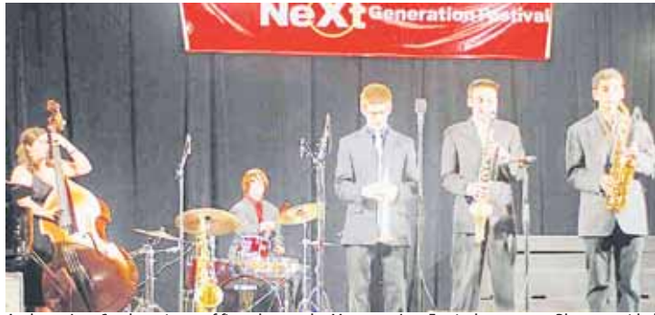
Acalanes Jazz Combo, winner of first place at the Monterey Jazz Festival

Once again the Acalanes High School Jazz Combo reaped the rewards of their many hours of practice with a first place finish last Saturday at the Monterey Jazz Festival's NeXT Generation Youth Jazz Combo Competition. This is a stellar jazz event because of the level of competition from fifty-four groups from four continents.