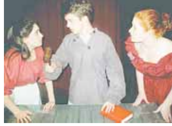
ter, 300 Moraga Road, Moraga. Tickets $8.00 at the door.