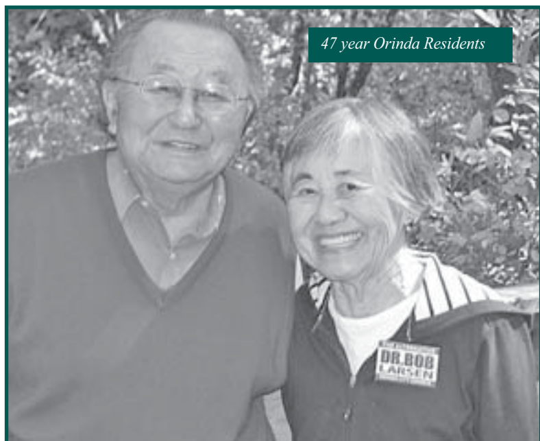
47 year Orinda Residents

Finally, someone who will represent our interests!