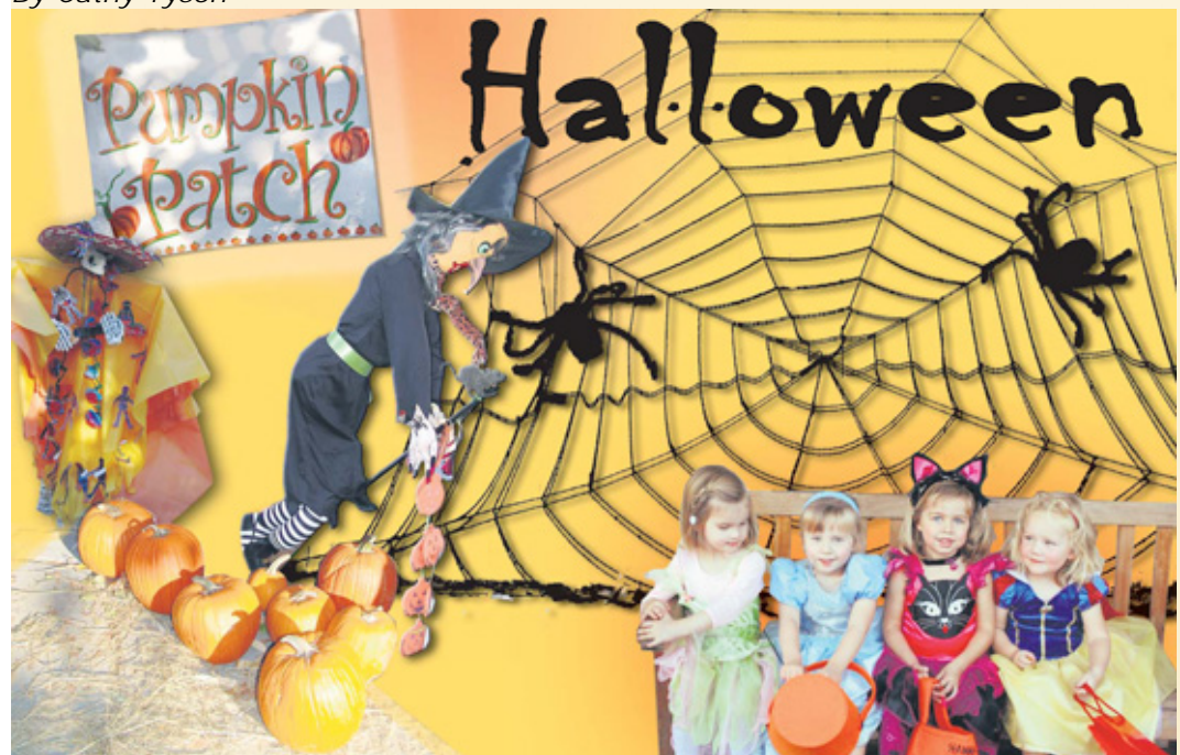
From Pumpkin Patch to Trick-or-Treating at ghoulishly garbed homes, Lamorinda's kids get ready for Halloween

Once again, the Lafayette Youth Commission (LYC) has worked long and hard to put together their annual Haunted House fundraiser event. Just a few weeks ago they still needed random body parts, toe tags and surgical scrubs, among other things, but it all came together into the truly creepy experience that has become an institution. This year's theme was Nightmare.