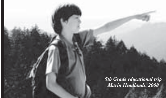
5th Grade educational trip Marin Headlands, 2008

Personal tours will also be scheduled at your convenience