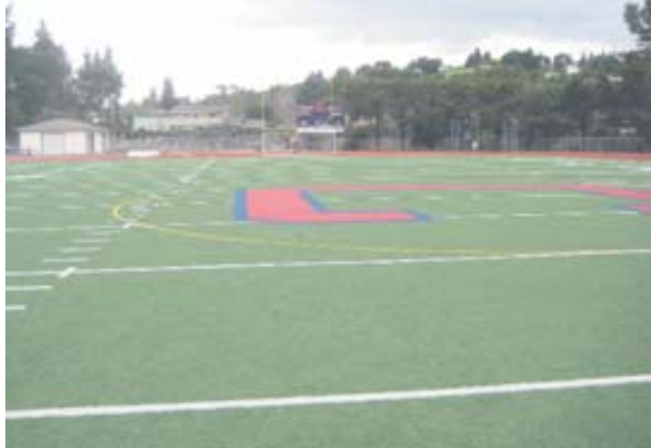
Campolindo's synthetic field, by FieldTurf