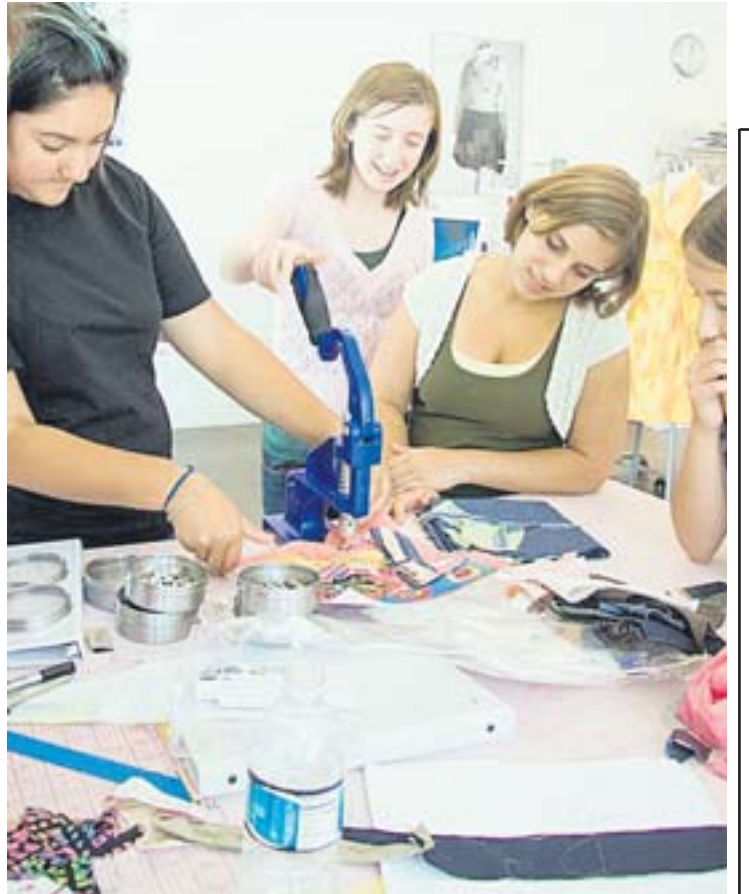
Teens at work, sewnow in Lafayette