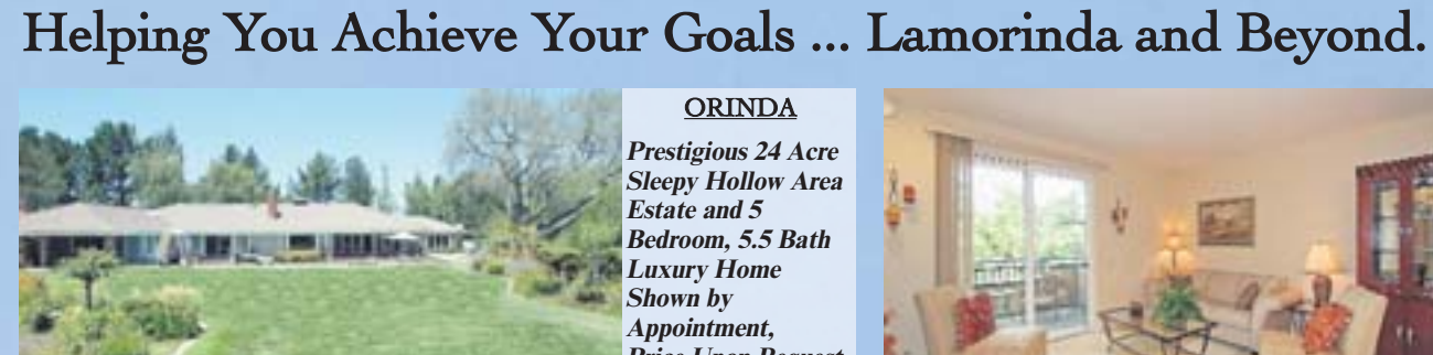
ORINDA Prestigious 24 Acre Sleepy Hollow Area Estate and 5 Bedroom, 5.5 Bath Luxury Home Shown by Appointment, Price Upon Request. Many Pics/Info on Our Website.