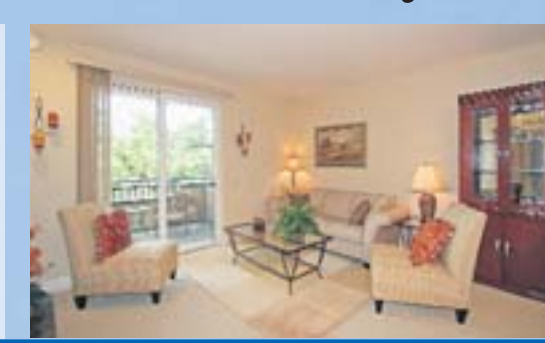
ORINDA Prestigious 24 Acre Sleepy Hollow Area Estate and 5 Bedroom, 5.5 Bath Luxury Home Shown by Appointment. Price Upon Request. Many Pics/Info on Our Website.

RESIDENTIAL BROKERAGE WALNUT CREEK New Listing $419,000, 2 Bedroom/2 Bath Luxury Condo with Fireplace, Deck, W&D, 2 Car Enclosed Parking. Top Quality New Construction!