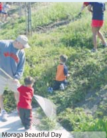
Moraga Beautiful Day

This third edition of the Faire at Rheem is centered on entertainment for all ages with many new events. From 11 a.m. to 4 p.m. the Moraga Chamber of Commerce has arranged for performances by local music groups, including Little Dog 2 and the Jazz Bands from both Campolindo High School and Joaquin Moraga Intermediate School; opportunities to buy arts, crafts and jewelry from a wide variety of artists; and a chance to sample food from local restaurants and wine from five or six area vintners. For the very first time the Moraga Juniors will sponsor a sidewalk chalk art contest. Up to 100 individuals or teams of individuals ages 3-18 may enter. Registration will begin at 11 a.m. the day of the event. A $1 participation fee covers the cost of the chalk. The theme is "Beautiful Moraga," and prizes will be awarded to winners in each age group: 3-5, 5-8, 9-12 & 13-18. Another Moraga first, a car show, will highlight classic cars owned by Lamorinda residents and give attendees a chance to see types of cars that aren't often seen on the streets and talk to the owners who have carefully restored them. In addition, there will be a climbing wall for the adventurous of all ages, as well as a bounce house and other children's activities. As always, many local retail and businesspeople will be on hand to showcase the wealth of resources in Moraga and will be joined by local nonprofit organizations. The event is supported by the Town of Moraga.