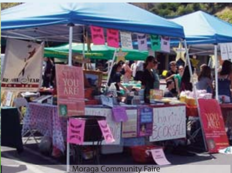
Moraga Community Faire