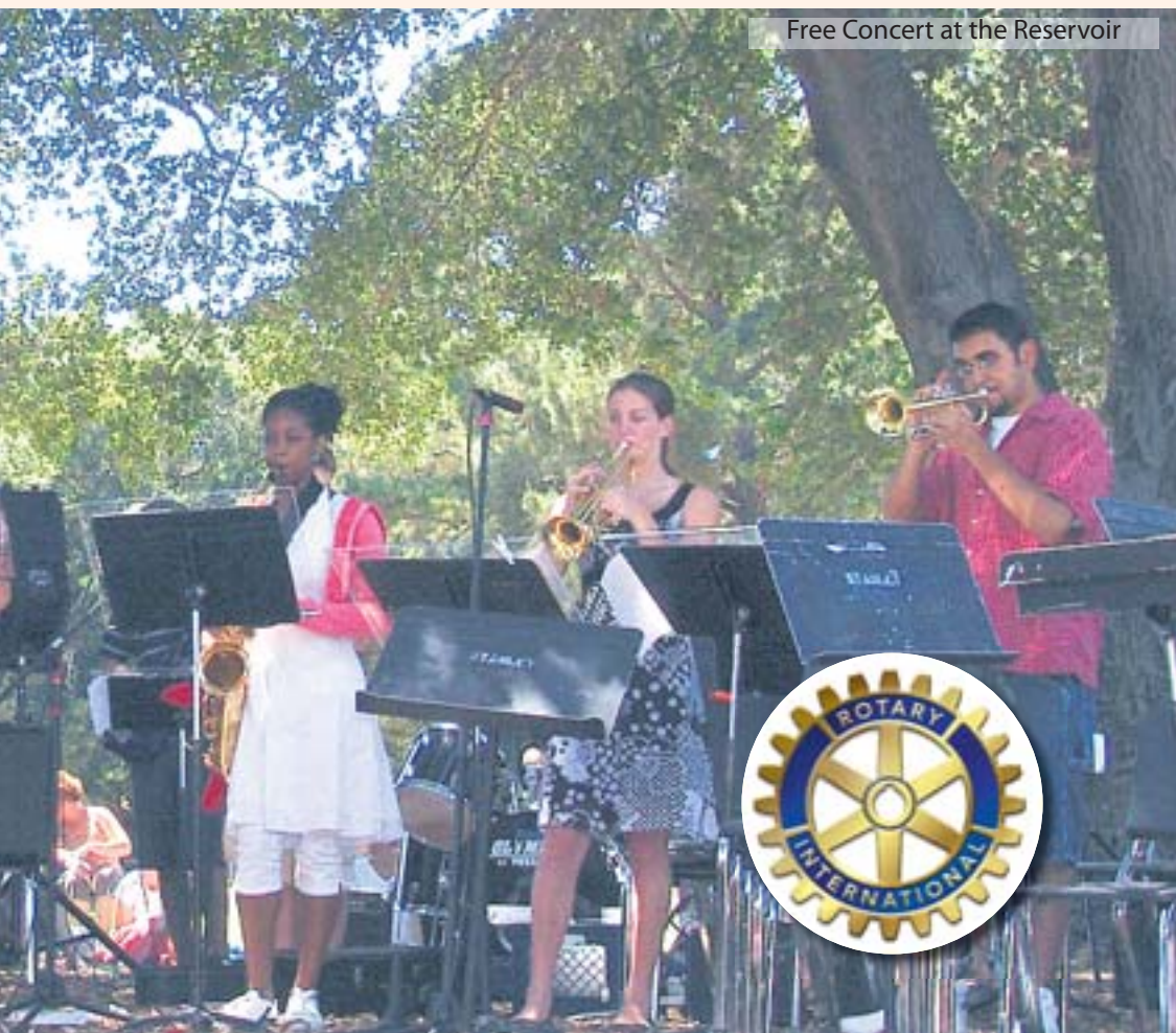
Free Concert at the Reservoir