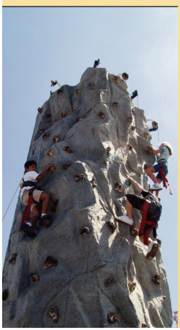
file:///C|/Documents%20and%20Settings/Andy/My%2...kly/archive/issue0303/Spring-Fun-in-Moraga.html (2 of 3) [4/14/2009 7:27:24 PM]

This third edition of the Faire at Rheem is centered on entertainment for all ages with many new events. From 11 a.m. to 4 p.m. the Moraga Chamber of Commerce has arranged for performances by local music groups, including Little Dog 2 and the Jazz Bands from both Campolindo High School and Joaquin Moraga Intermediate School; opportunities to buy arts, crafts and jewelry from a wide variety of artists; and a chance to sample food from local restaurants and wine from five or six area vintners. For the very first time the Moraga Juniors will sponsor a sidewalk chalk art contest. Up to 100 individuals or teams of individuals ages 3-18 may enter. Registration will begin at 11 a.m. the day of the event. A $1 participation fee covers the cost of the chalk. The theme is "Beautiful Moraga," and prizes will be awarded to winners in each age group: 3-5, 5-8, 9-12 & 13-18. Another Moraga first, a car show, will highlight classic cars owned by Lamorinda residents and give attendees a chance to see types of cars that aren't often seen on the streets and talk to the owners who have carefully restored them. In addition, there will be a climbing wall for the adventurous of all ages, as well as a bounce house and other children's activities. As always, many local retail and businesspeople will be on hand to showcase the wealth of resources in Moraga and will be joined by local nonprofit organizations. The event is supported by the Town of Moraga.