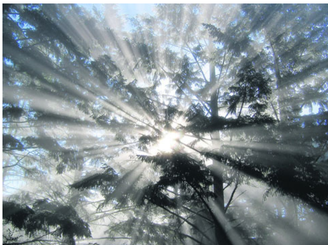
"The Light Comes Through" Caitlin Burnite